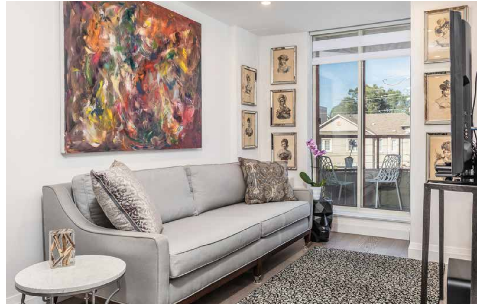
SUITE # 410 APPROX. 1450 SQUARE FEET