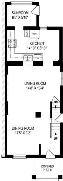
MAIN FLOOR 674 SQUARE FEET