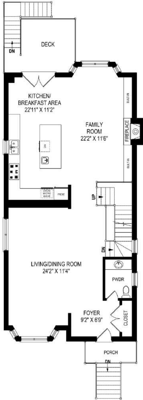
MAIN FLOOR 1275 SQUARE FEET