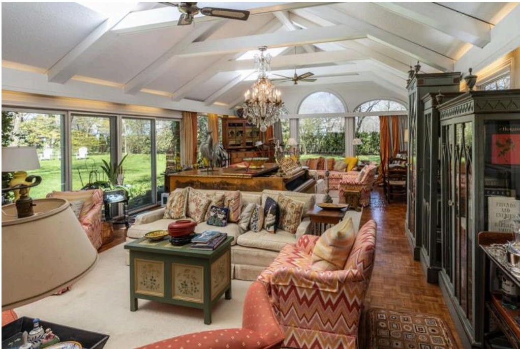
An outdoor porch was closed in to create a living room addition.