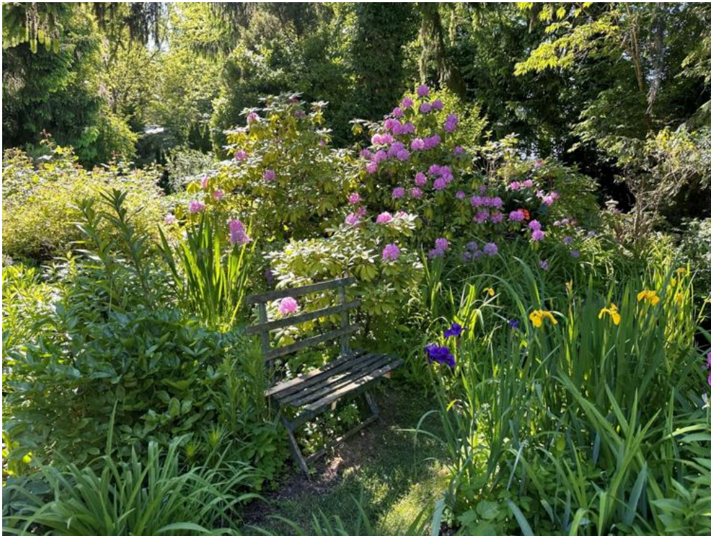
The property features extensive gardens.