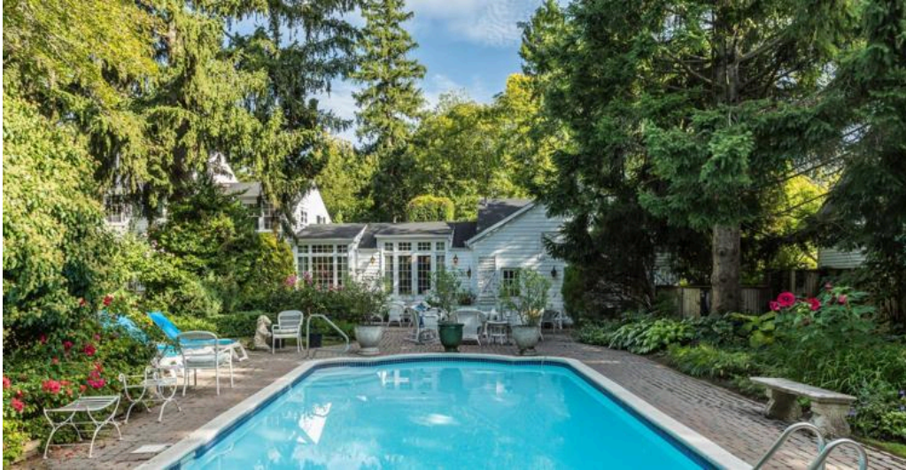
The two-storey home features an in-ground pool.