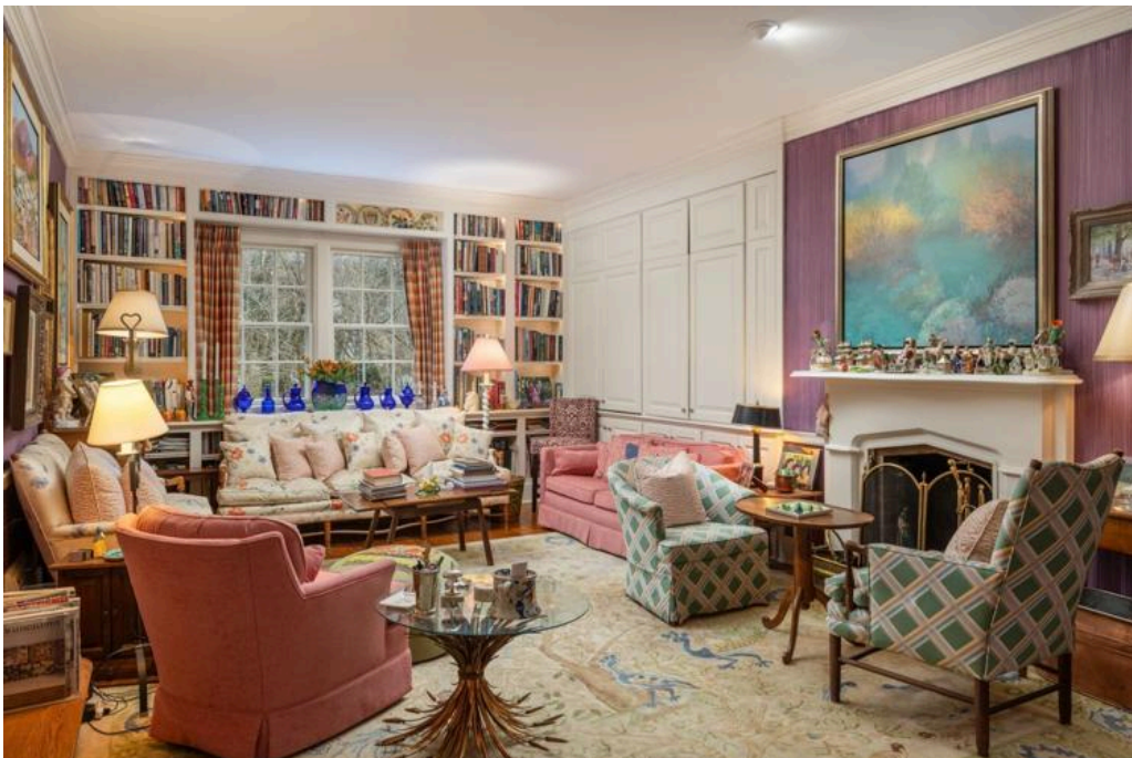
The sitting room.