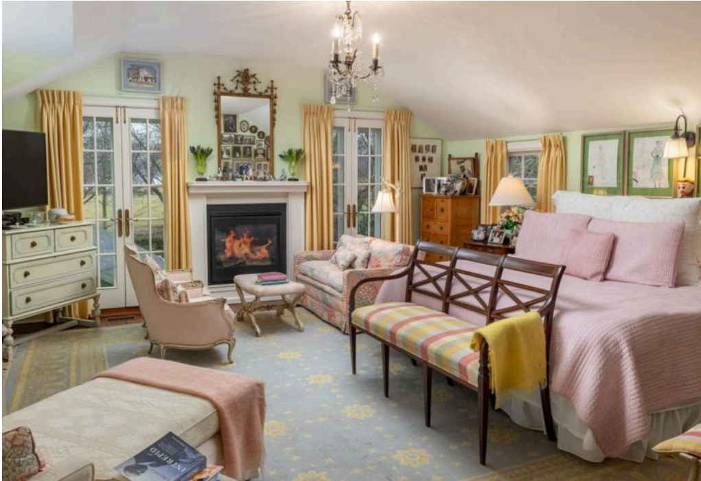
The primary bedroom features a recently installed gas fireplace.

“I like the fact that the views really change depending on what’s happening on the lake.”