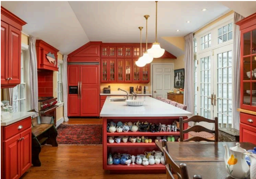
The renovated kitchen.